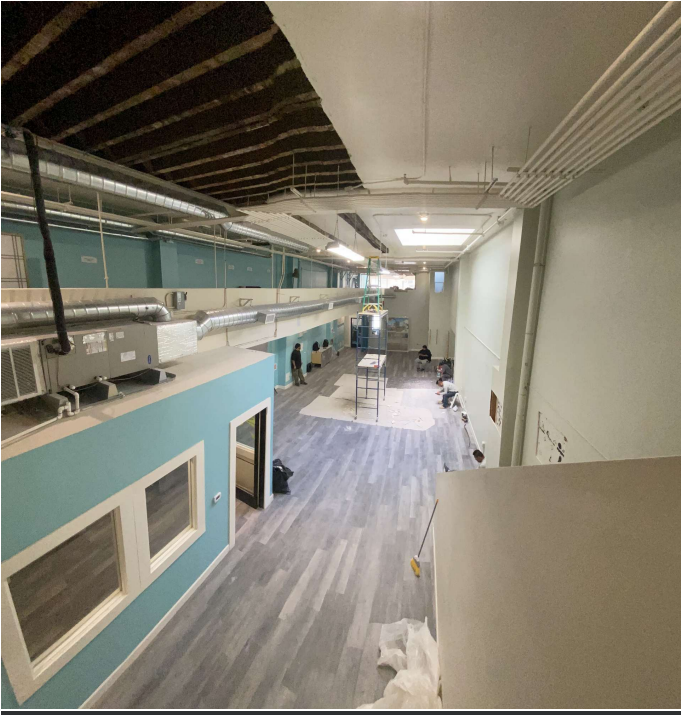
Multi-Story Retail Space with Offices