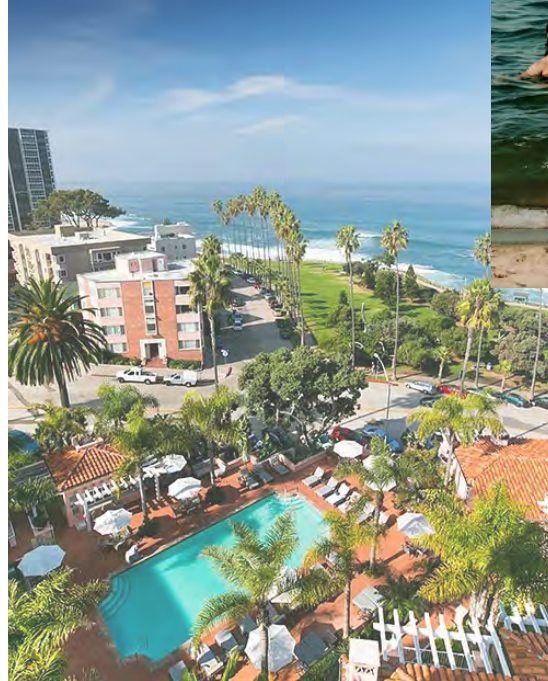
La Valencia Hotel