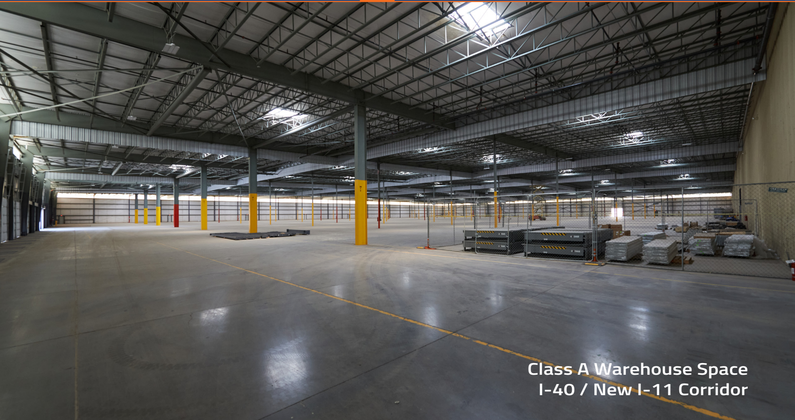
Class A Warehouse Space I-40 / New I-11 Corridor