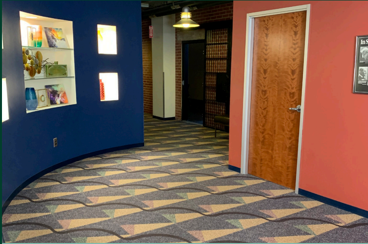
High Quality Finishes Throughout