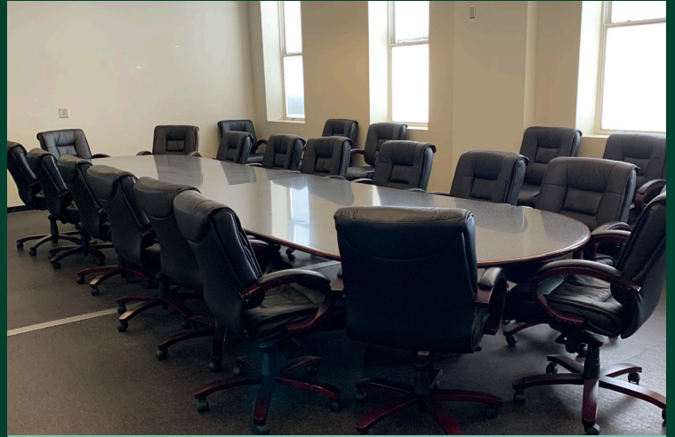
Multiple Conference Rooms