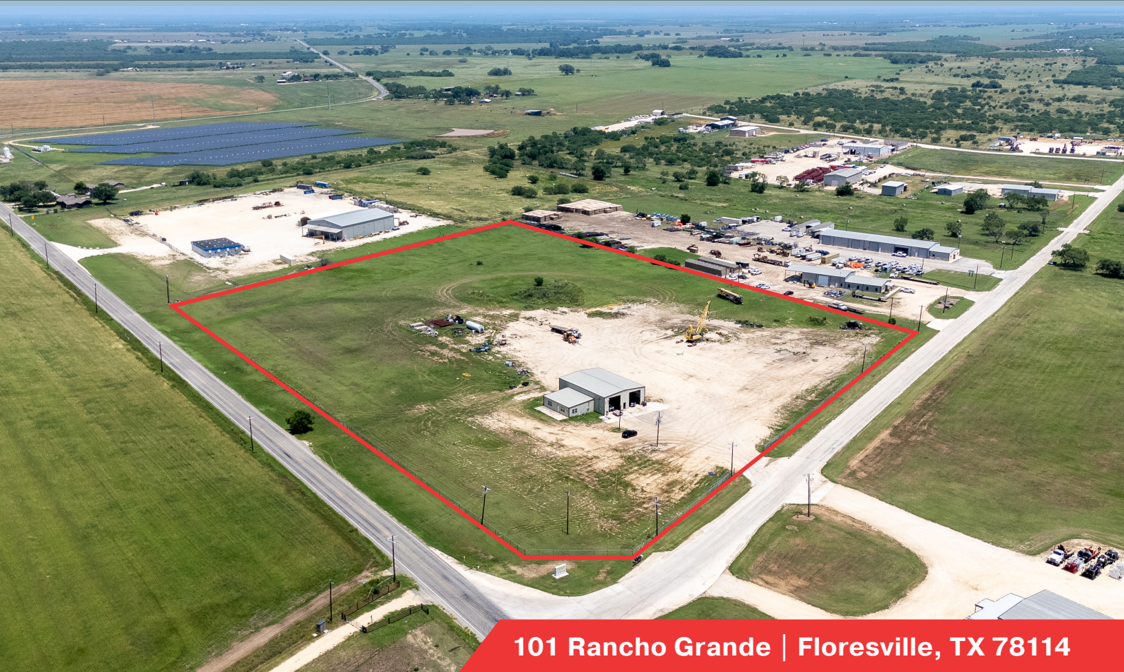
101 Rancho Grande | Floresville, TX 78114