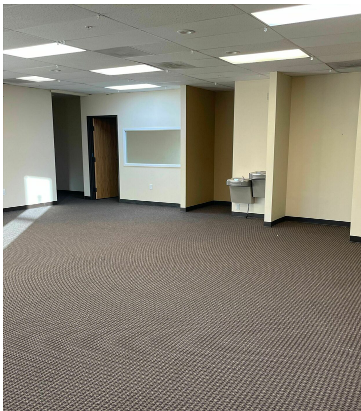
Open Work Area