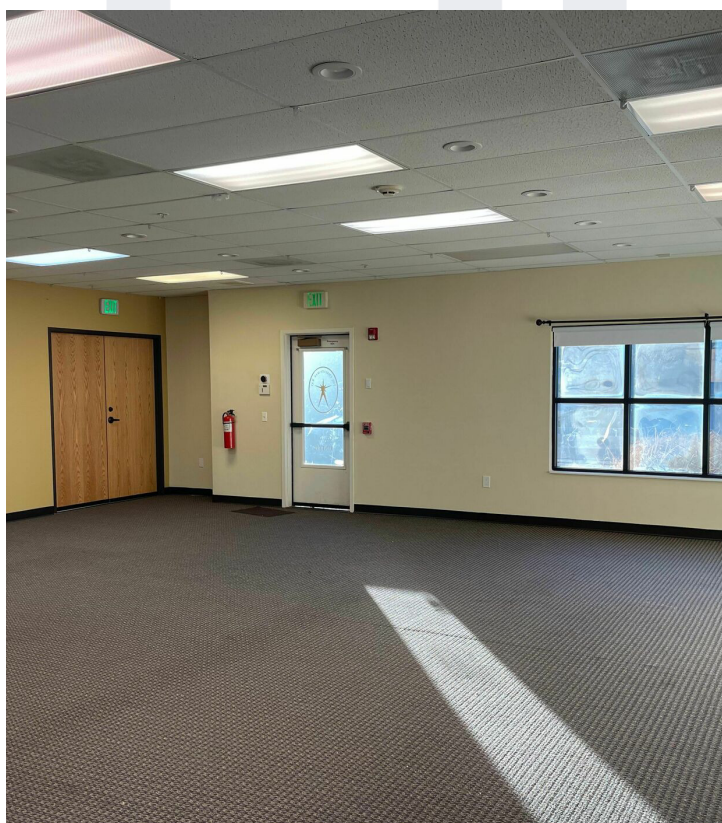
Main Suite Entry