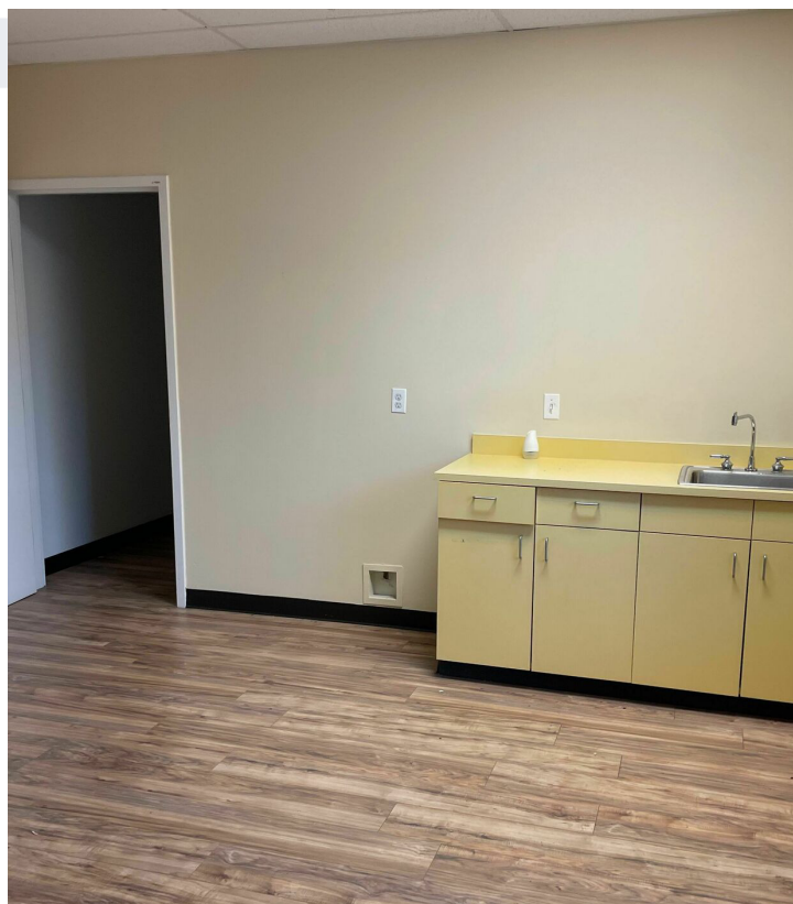
Exam Room or Office