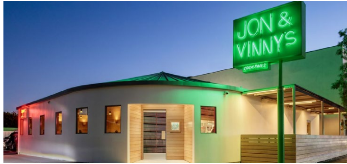
Jon & Vinny's is a local favorite spot offering delicious Italian-American comfort food, including wood-fired pizzas and handmade pastas.

No warranty or representation is made to the accuracy of the foregoing information. Terms of sale or lease are subject to change or withdrawal without notice. ©2024 INDUSTRY PARTNERS, INC.