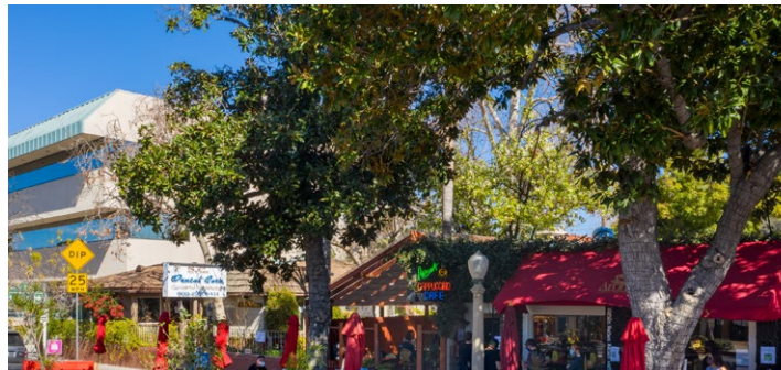
Aroma Cafe. Cozy cafe with breakfast, sandwich, salad, pastry & coffee options plus backyard patio seating.