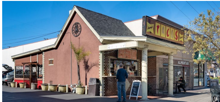
Henry's Tacos. Popular, longtime taco stand offering window service, a simple menu & a few outdoor tables.