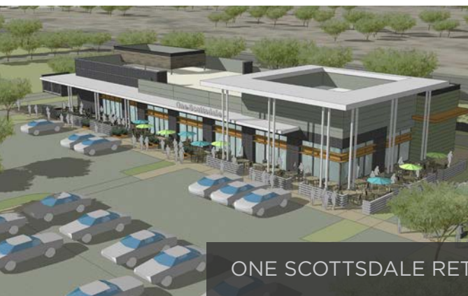
ONE SCOTTSDALE RETAIL

The Phoenix/Scottsdale area is home to more FIVE-STAR & AAA FIVE-DIAMOND RESORTS than any other destination in the U.S.