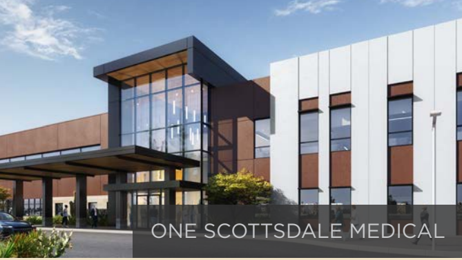
ONE SCOTTSDALE MEDICAL