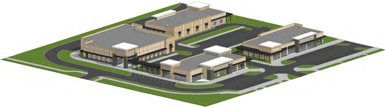
2 NORTHWEST AXO SCALE IS APPROX.