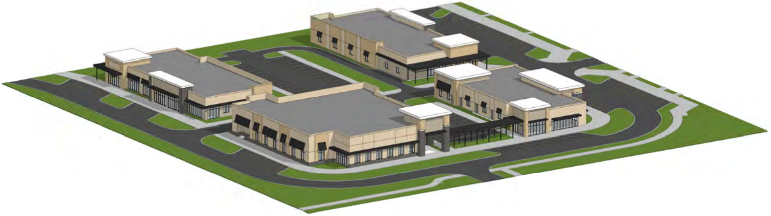
1 NORTHEAST AXO SCALE IS APPROX.