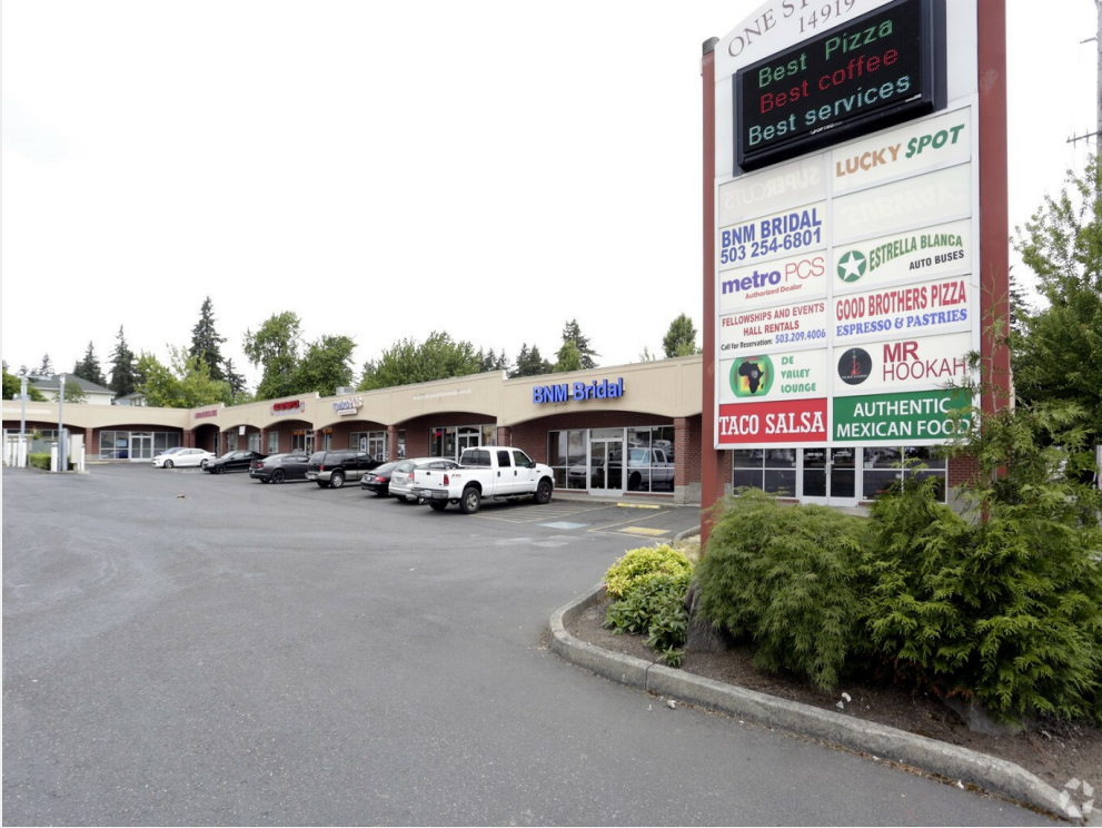
Strip Mall Entrance