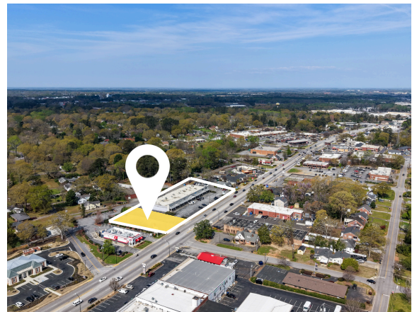
ANDERSON COUNTY DJI 20260323113237-0608