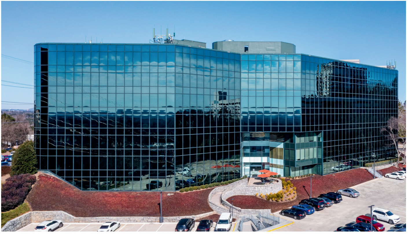
2849 PACES FERRY RD SE