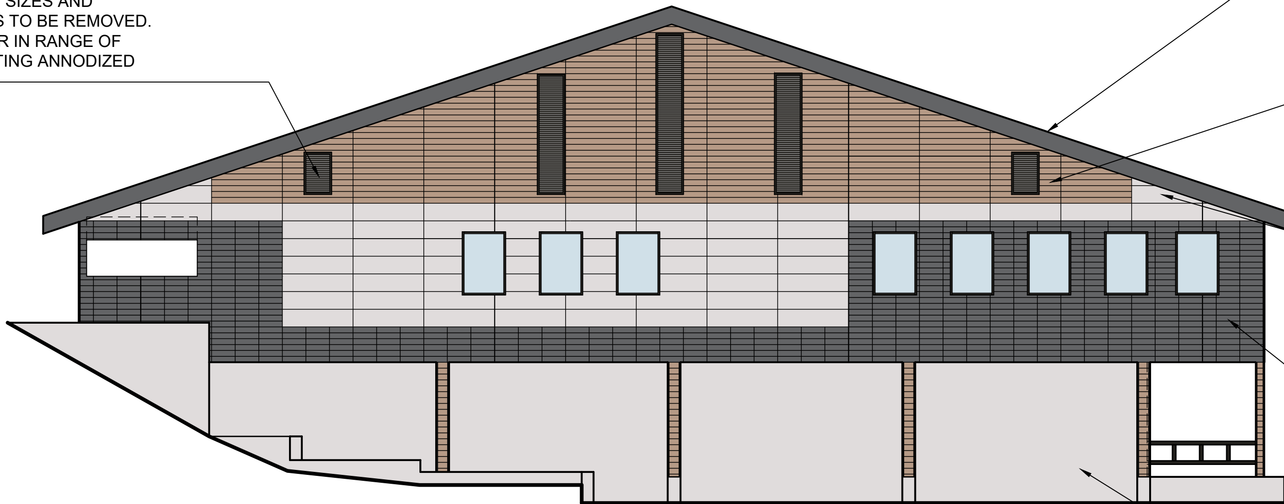
SIDE BUILDING ELEVATION

DEMO PROJECTING GABLE END VENT SURROUNDS AND PROVIDE NEW LOUVERED VENTS FLUSH WITH EXTERIOR WALL FINISH. MATCH SIZES AND LOCATIONS OF EXISTING VENTS TO BE REMOVED. FINISH TO APPROXIMATE COLOR IN RANGE OF HUES CONTAINED WITHIN EXISTING ANNOIDIZED BRONZE STOREFRONTS, TYP.