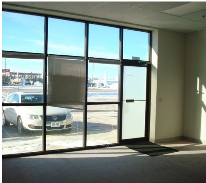
Front Windows and Entry Door