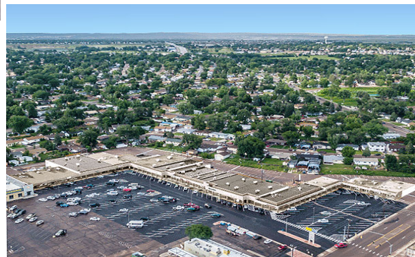
all photographic-imagining | Copyright © 2024 J. Barry Winter | All Rights Reserved