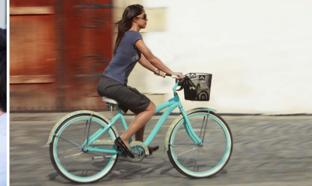
GOLETA'S FINEST VILLAGE LIVING