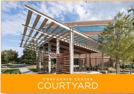
CORPORATE CENTER COURTYARD