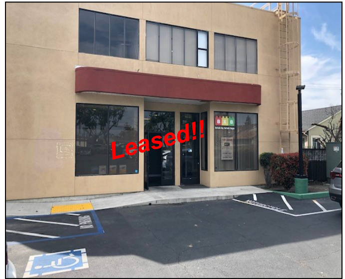
Suite B Ground Floor