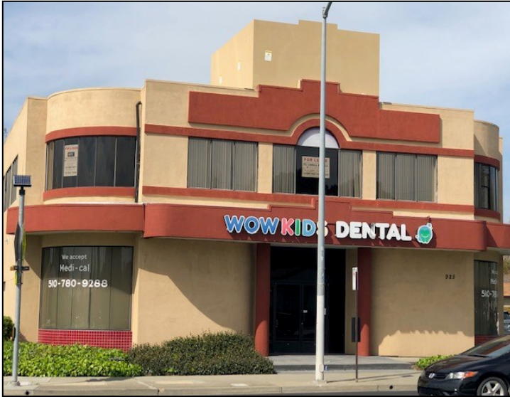
Suite C Second Floor