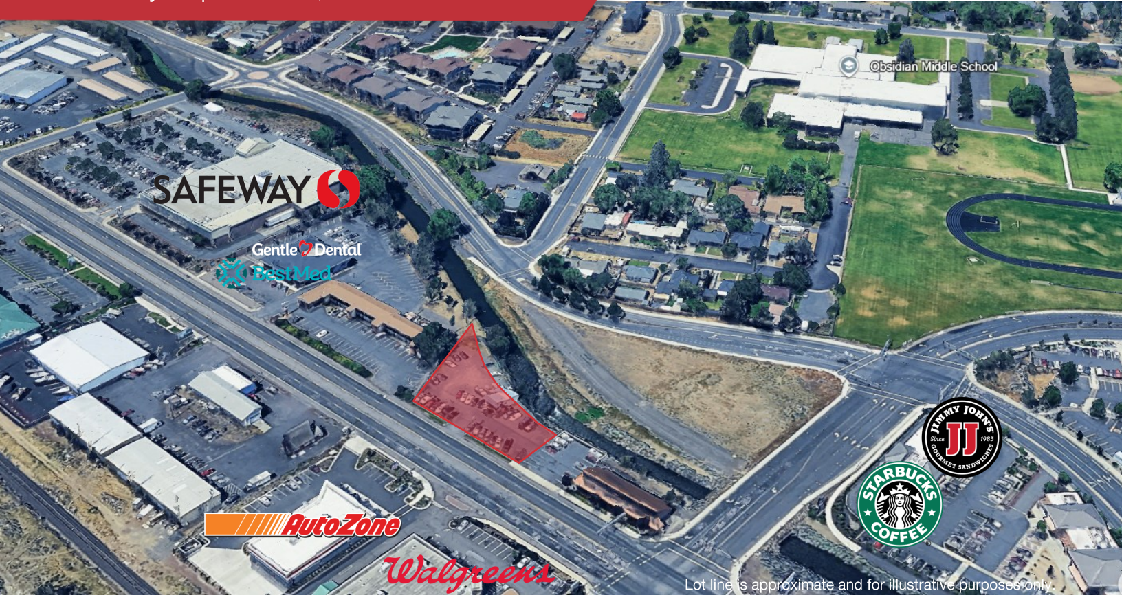
Lot line is approximate and for illustrative purposes only.