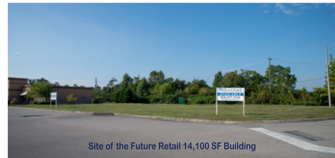
Site of the Future Retail 14,100 SF Building

Disclaimer: While Broad Reach Retail Partners, LLC and its affiliates believe the information contained herein to be true and accurate, they make no claims or warranties. Any prospective tenant should conduct thorough, independent due diligence.