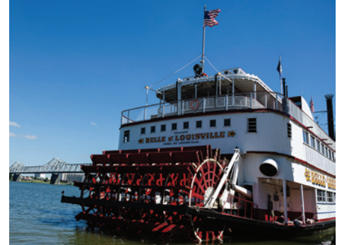
The city is home to the world's oldest operating Mississippi River-style steamboat, The Belle of Louisville.

The city continues to grow and expand with over 15 Billion in investments since 2014, making it a key destination for business and people.