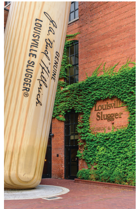
The Louisville Slugger Museum & Factory features a 120-foot-tall steel replica of the iconic baseball bat, and the company, Hillerich & Bradsby, was founded in 1864, with the bat's name originating from a local player nicknamed "Louisville Slugger".