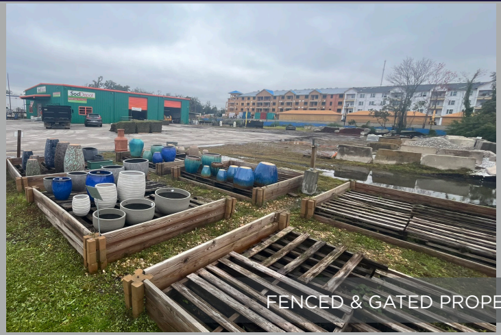
FENCED & GATED PROPERTY

©2025 CUSHMAN & WAKEFIELD. ALL RIGHTS RESERVED. THE INFORMATION CONTAINED IN THIS COMMUNICATION IS STRICTLY CONFIDENTIAL. THIS INFORMATION HAS BEEN OBTAINED FROM SOURCES BELIEVED TO BE RELIABLE BUT HAS NOT BEEN VERIFIED. NO WARRANTY OR REPRESENTATION, EXPRESS OR IMPLIED, IS MADE AS TO THE CONDITION OF THE PROPERTY (OR PROPERTIES) REFERENCED HEREIN OR AS TO THE ACCURACY OR COMPLETENESS OF THE INFORMATION CONTAINED HEREIN, AND SAME IS SUBMITTED SUBJECT TO ERRORS, OMISSIONS, CHANGE OF PRICE, RENTAL OR OTHER CONDITIONS, WITHDRAWAL WITHOUT NOTICE, AND TO ANY SPECIAL LISTING CONDITIONS IMPOSED BY THE PROPERTY OWNER(S). ANY PROJECTIONS, OPINIONS OR ESTIMATES ARE SUBJECT TO UNCERTAINTY AND DO NOT SIGNIFY CURRENT OR FUTURE PROPERTY PERFORMANCE.