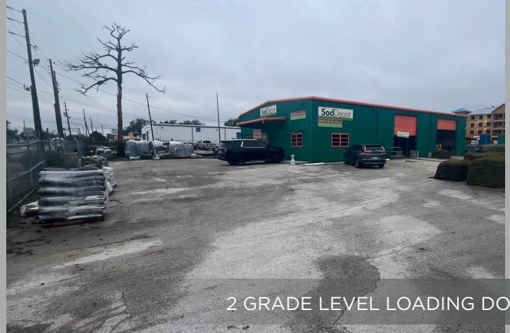
2 GRADE LEVEL LOADING DOORS