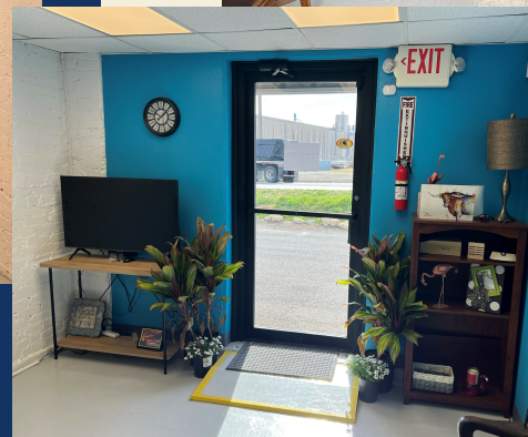
Outside breakroom. Storage available on top of BR area.