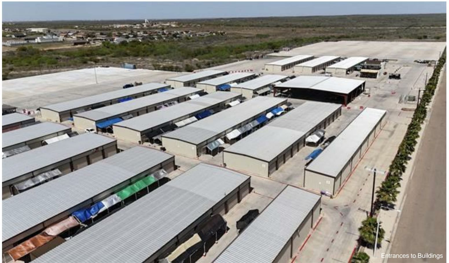
Entrances to Buildings