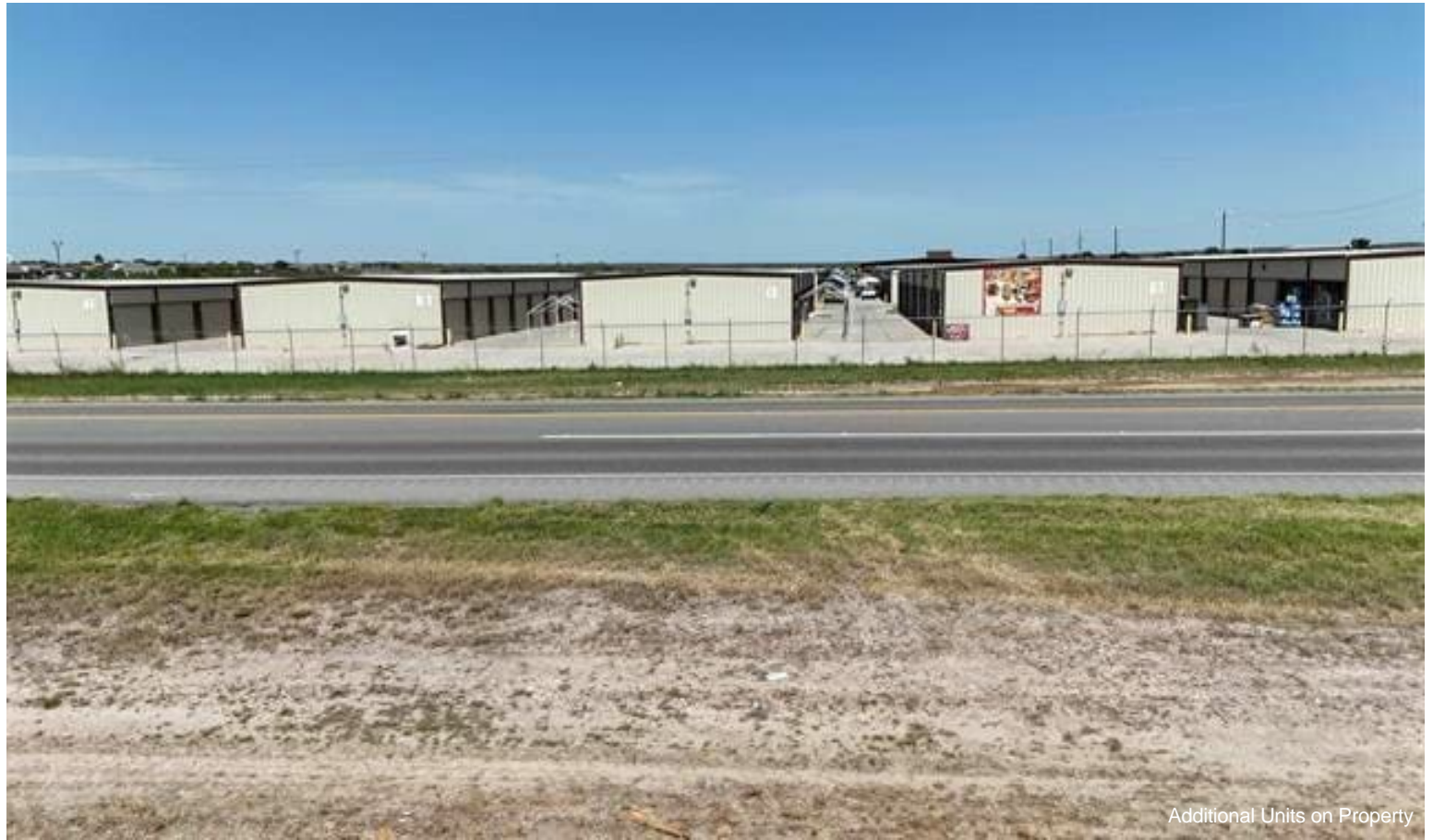
Additional Units on Property