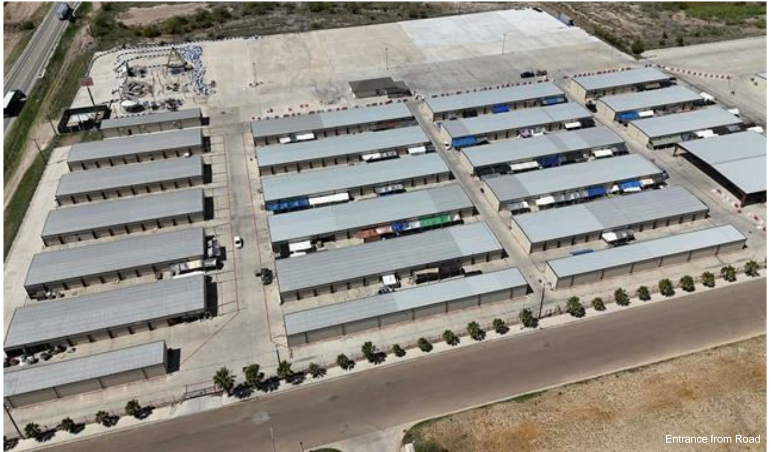
Entrance from Road