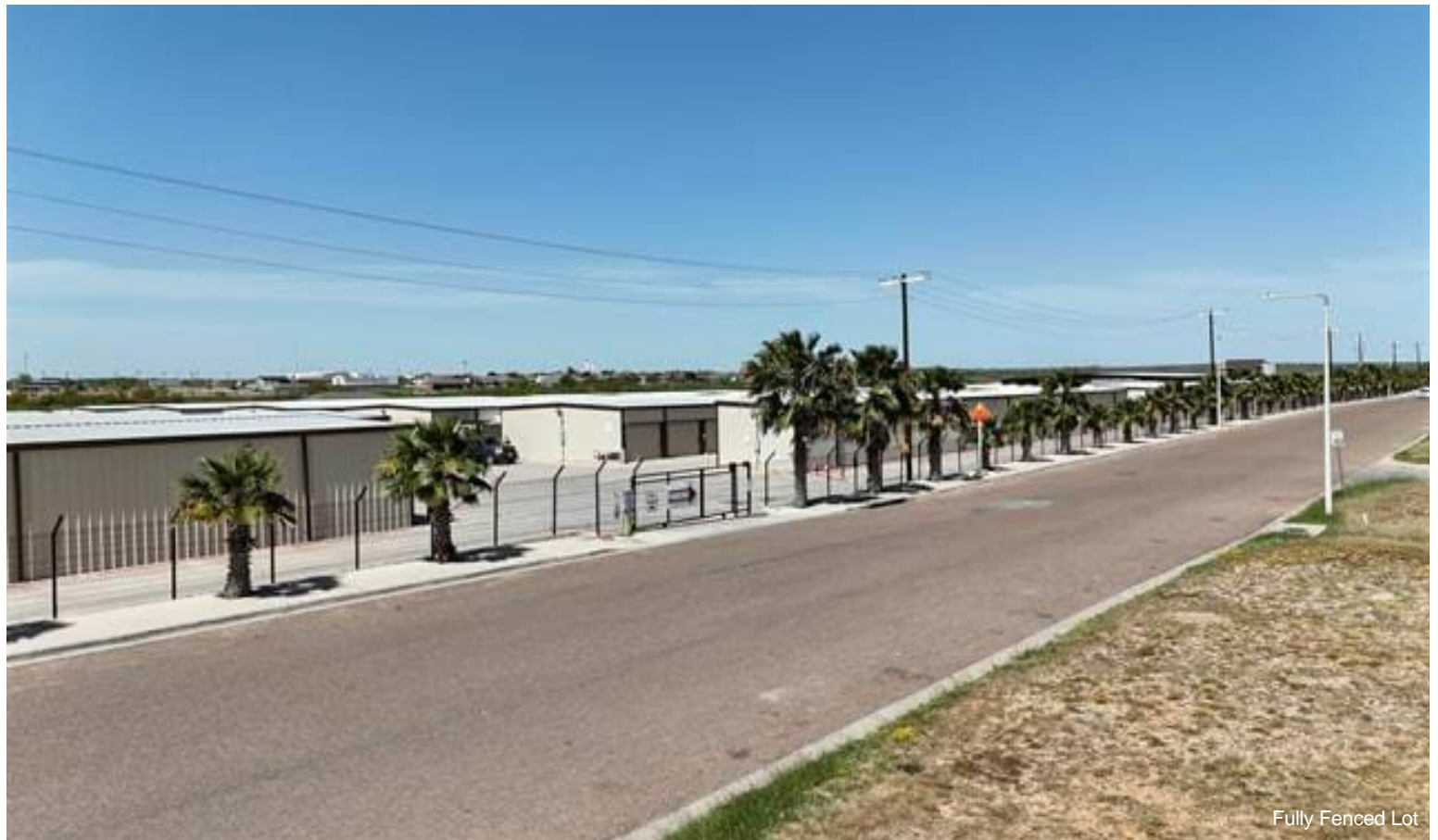
Fully Fenced Lot