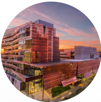
Phoenix Biomedical Campus