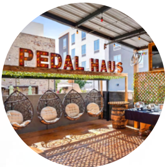
Pedal Haus Brewery