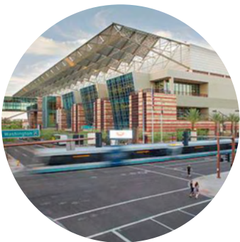
Phoenix Convention Center