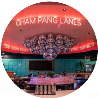
Cham Pang Lanes