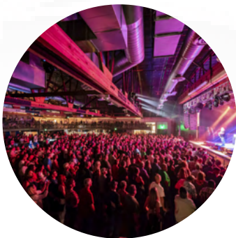
The Van Buren