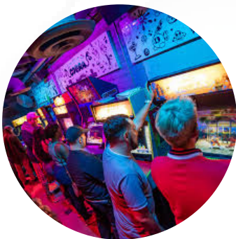
Cobra Arcade Bar