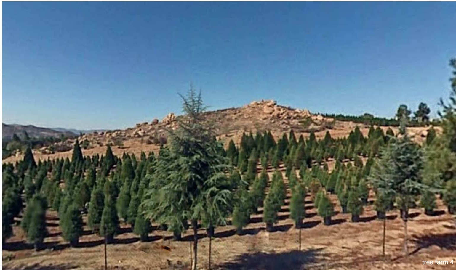
tree farm 4