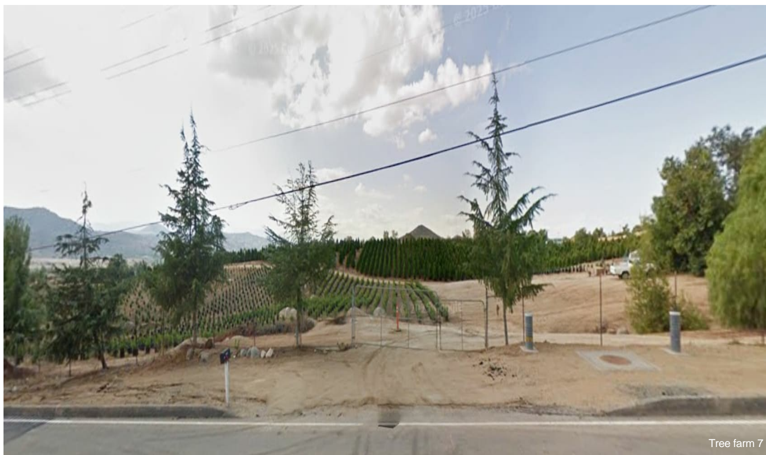
Tree farm 7