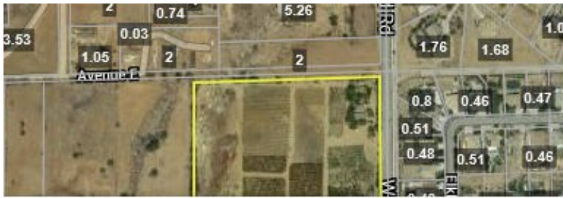
19255 Wood Rd Perris, CA 92570, Riverside County