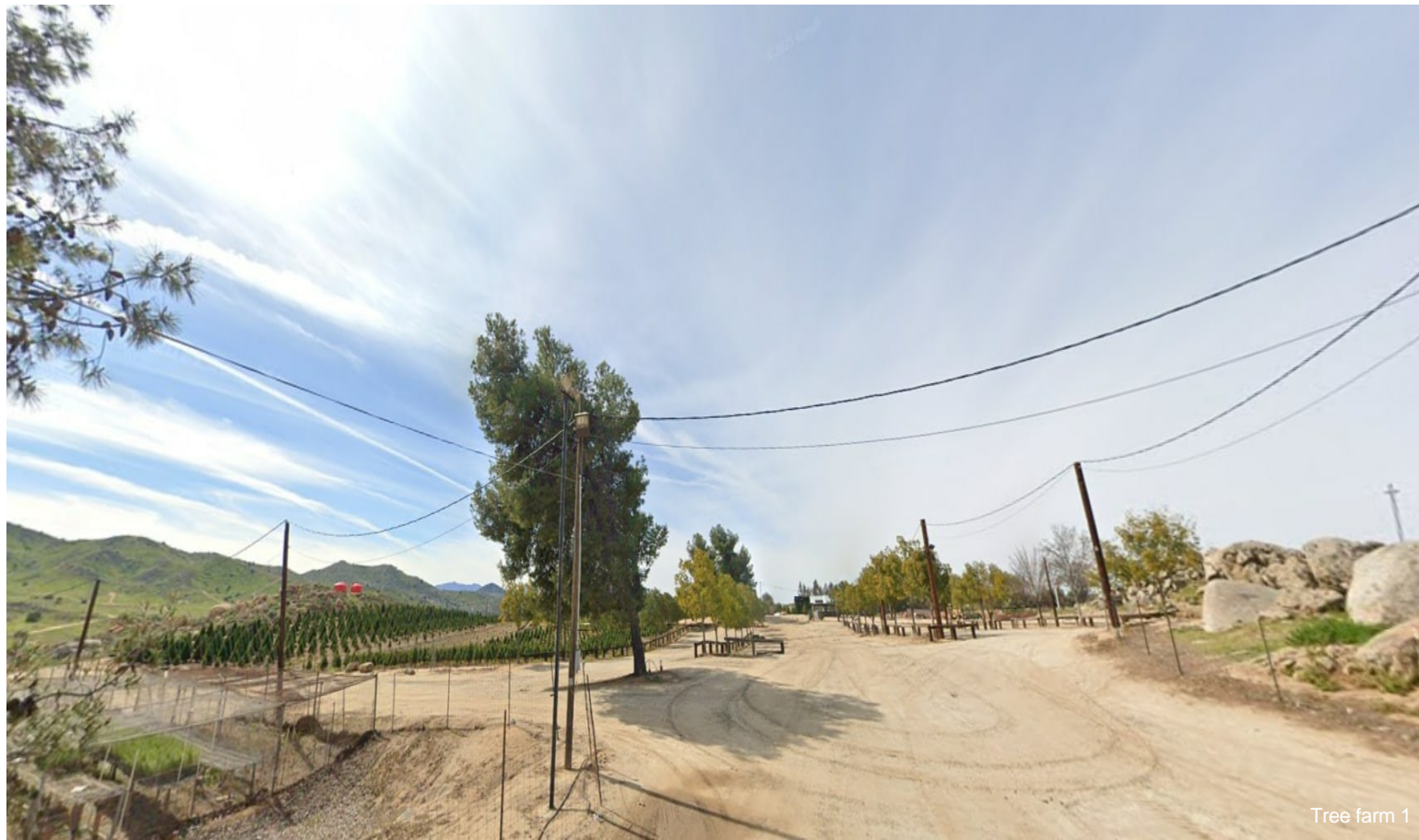
Tree farm 1