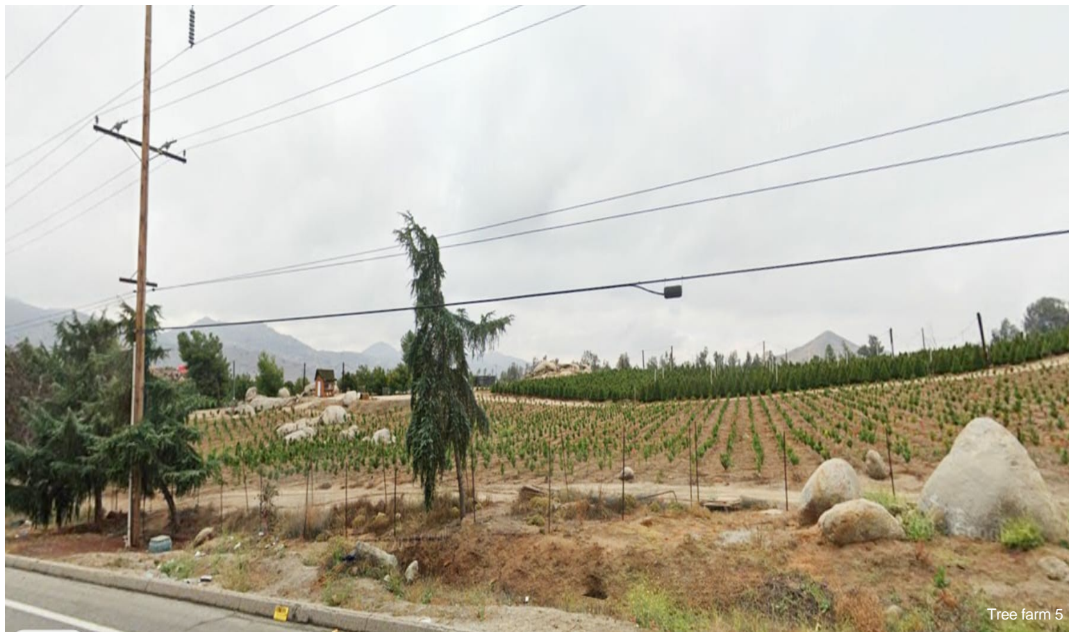
Tree farm 5