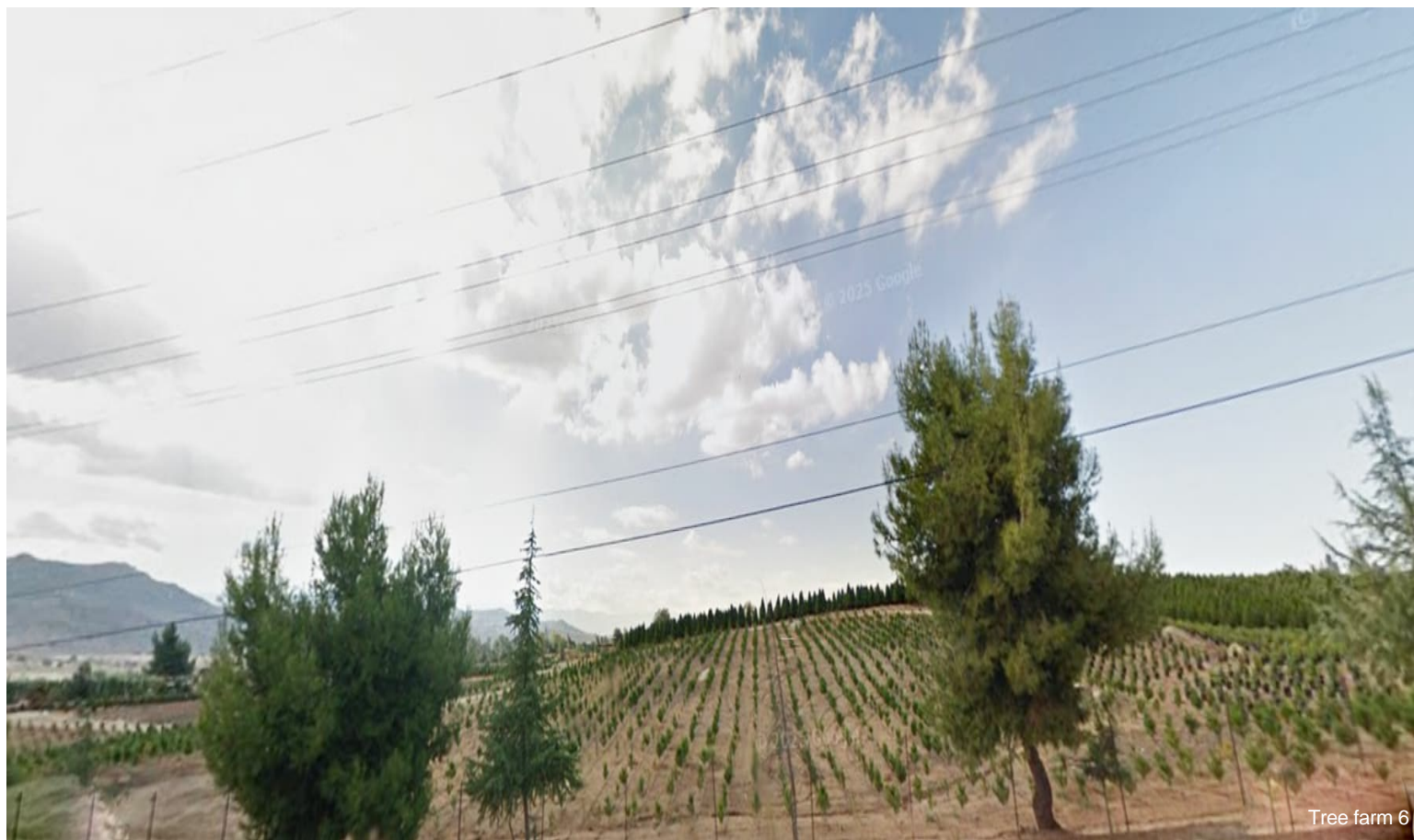
Tree farm 6