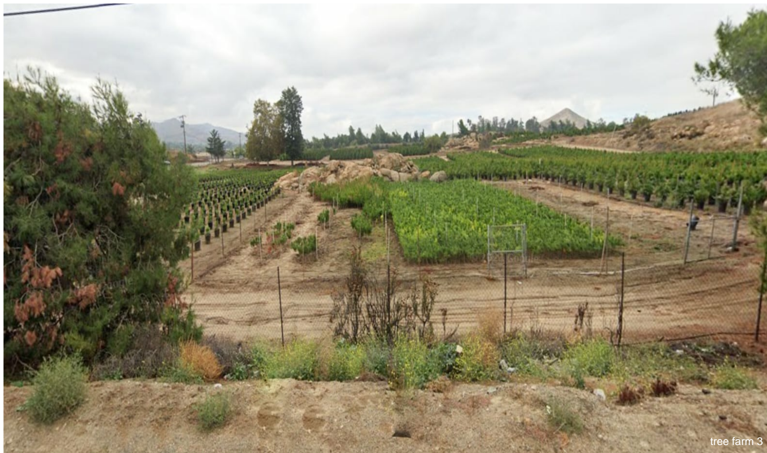
tree farm 3