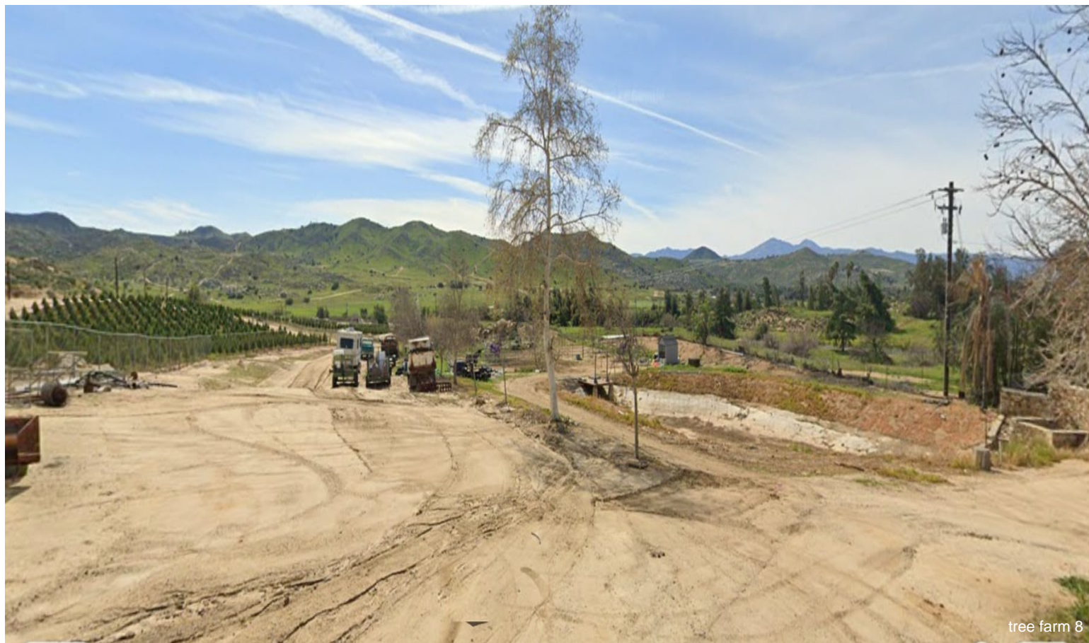
tree farm 8