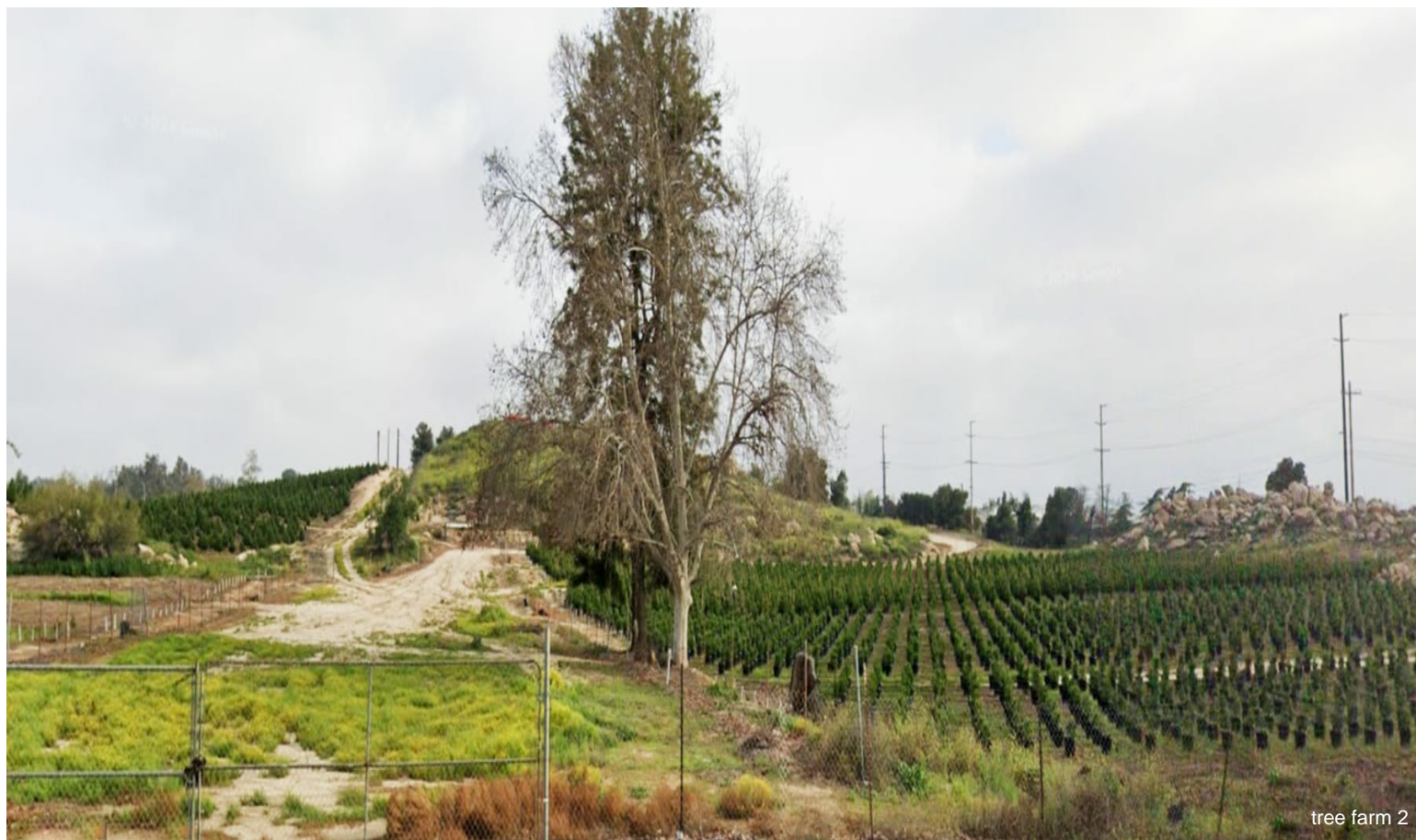
tree farm 2