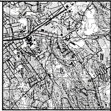
LOCATION MAP EAST STROUDSBURG AREA, PENNSYLVANIA