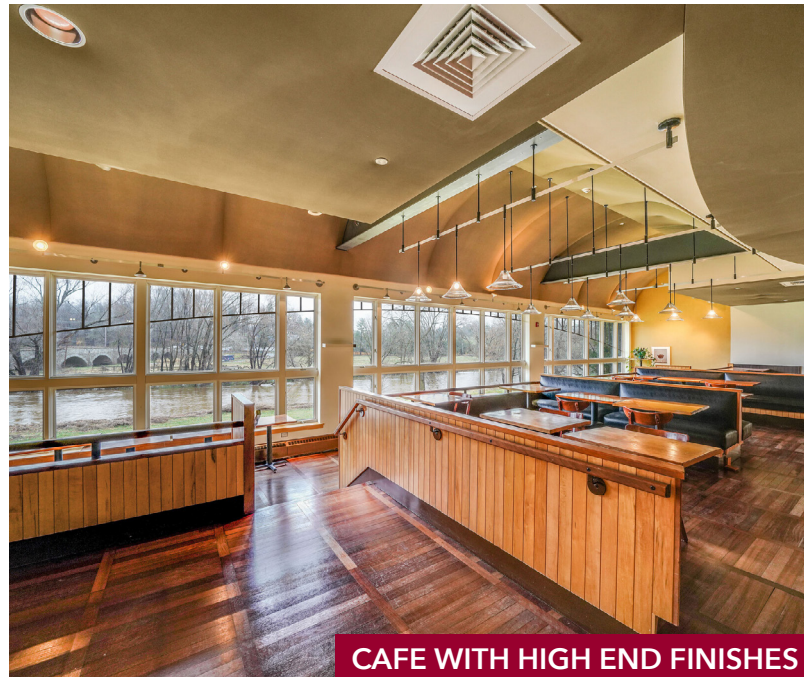
CAFE WITH HIGH END FINISHES

MATT MACDONALD matt.macdonald@lee-associates.com 610.212.6638