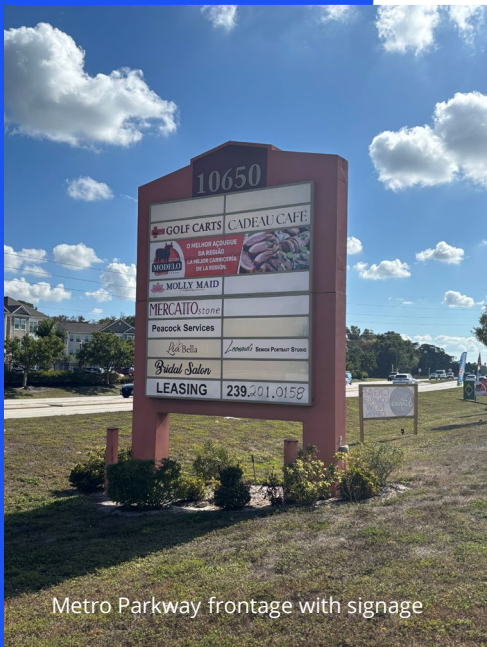
Metro Parkway frontage with signage

Perfect for businesses seeking a strategic location with functional space and strong exposure