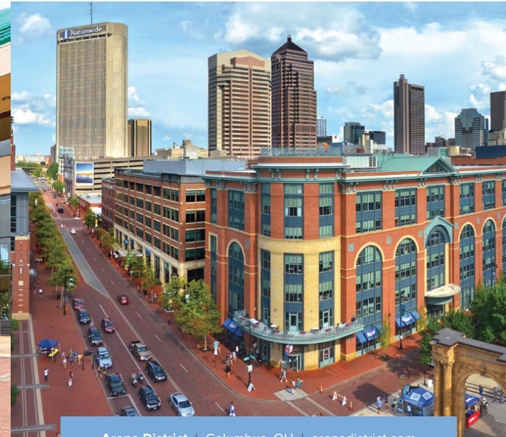
Arena District | Columbus, OH | arenadistrict.com

Nationwide Realty Investors is the real estate development affiliate of Nationwide Insurance, and is nationally recognized as one of the country's leading developers of large, complex, mixed-use projects. Directly and through joint ventures, Nationwide Realty Investors controls more than $2 billion in commercial and residential real estate investments.