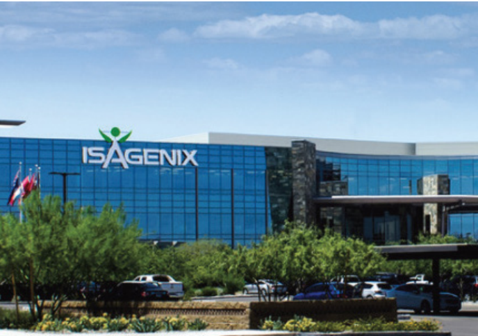
Rivulon | Gilbert, AZ | rivulon.com