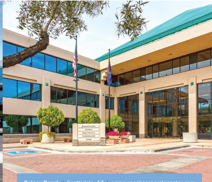
Gainey Ranch | Scottsdale, AZ | gaineyranchcorporatecenter.com