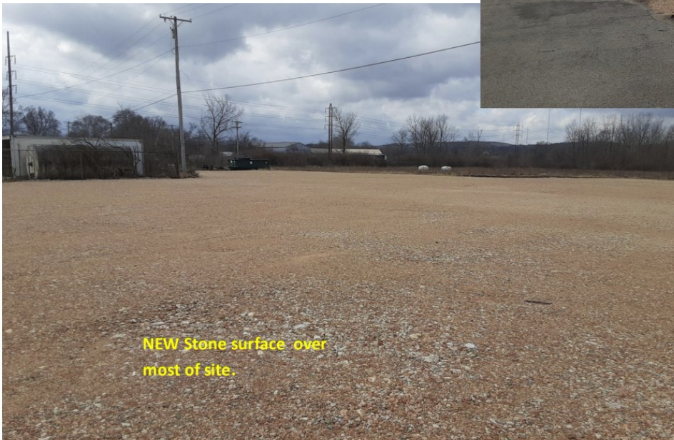
NEW Stone surface over most of site.