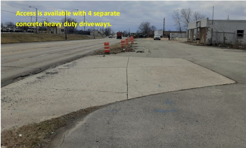
Access is available with 4 separate concrete heavy duty driveways.