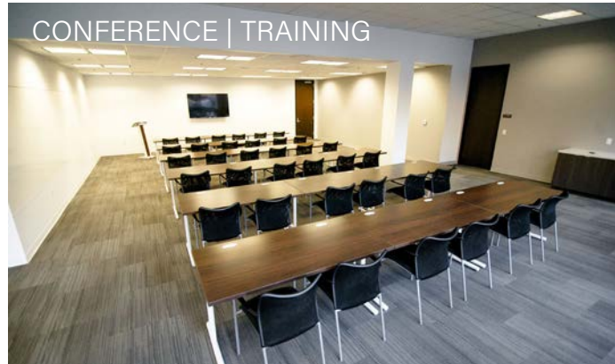
CONFERENCE | TRAINING