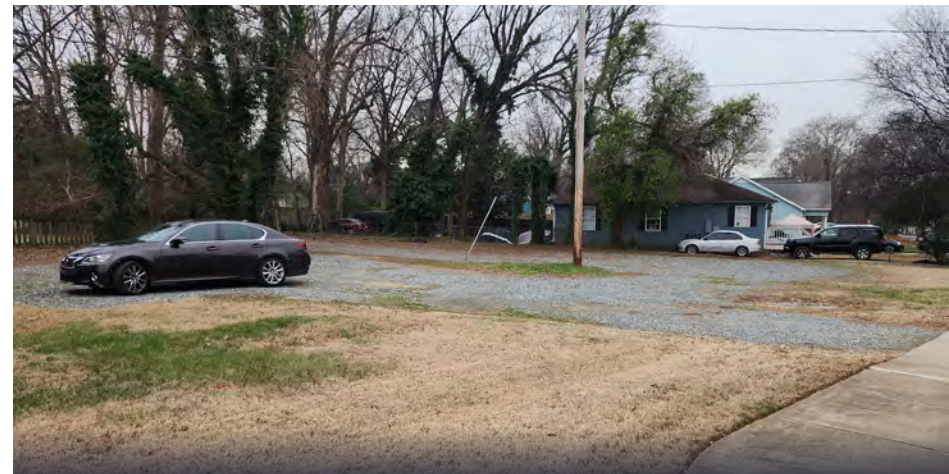
PARKING AVAILABLE IN BACK