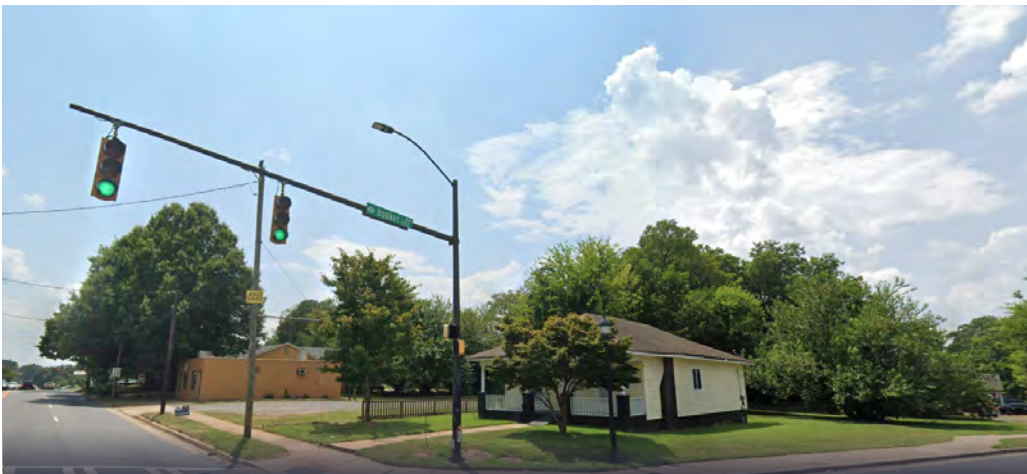
LOCATED ON HARD CORNER