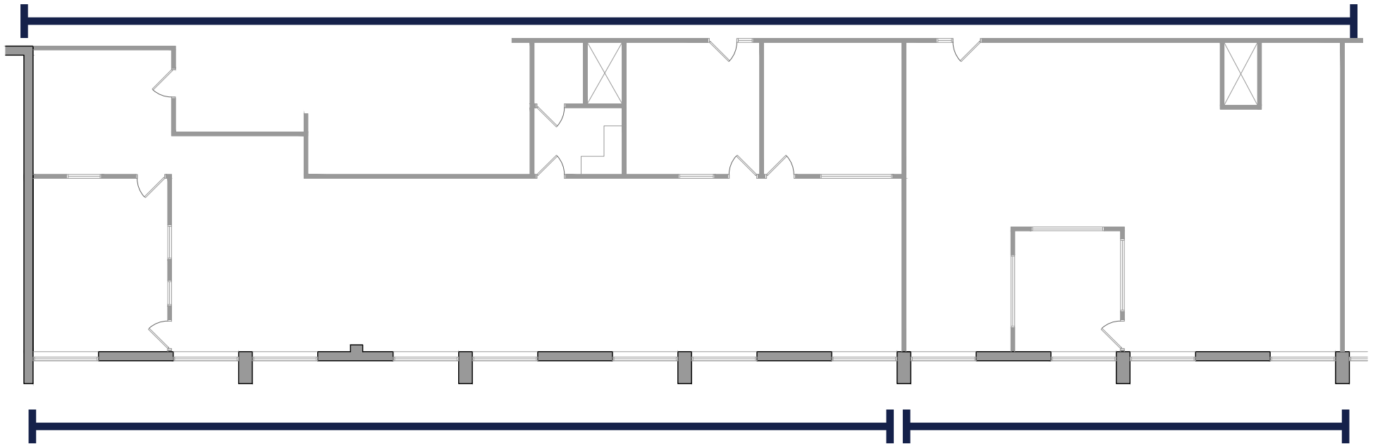
SUITE C 2,688 SF