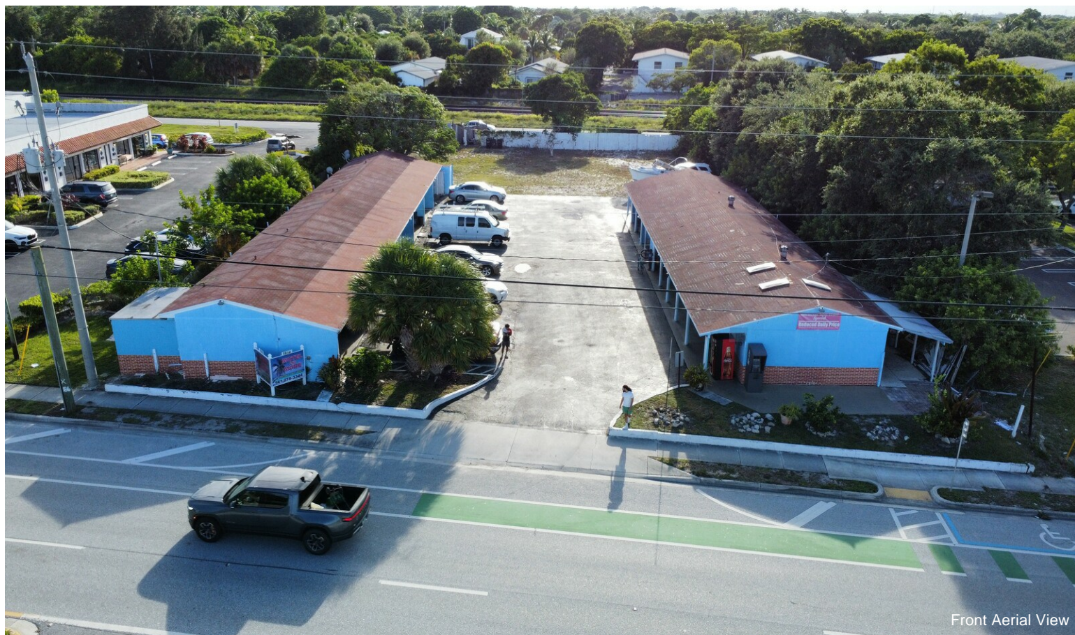
Front Aerial View