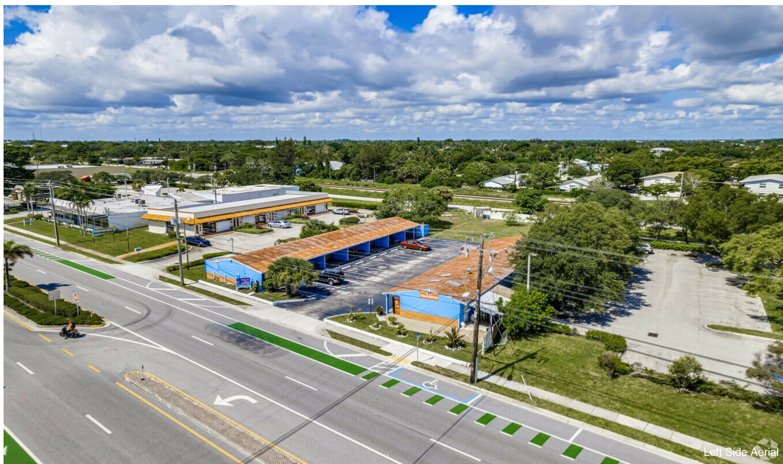
Left Side Aerial