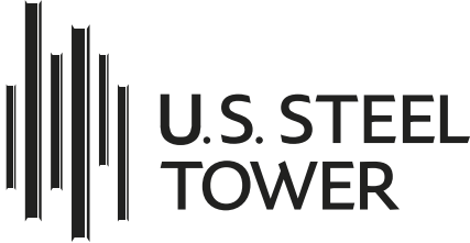
TENANT EXPERIENCE SPACE