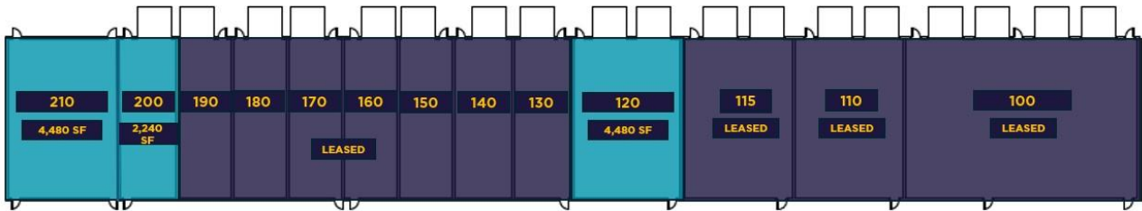
Building 4 - 16150 Lee Rd