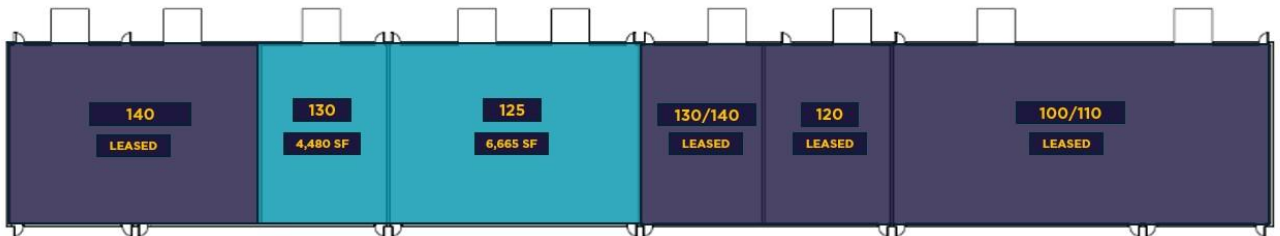
Building 2- 16130 Lee Rd