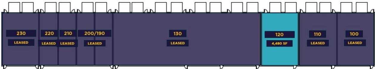
Building 8 - 16190 Lee Rd