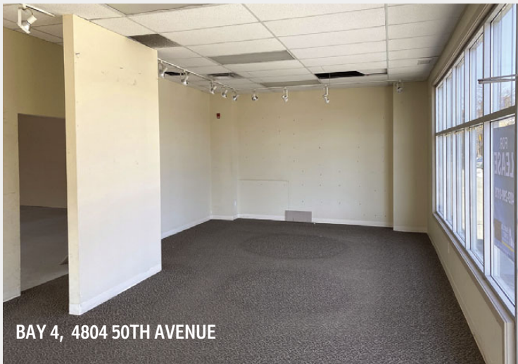
BAY 4, 4804 50TH AVENUE