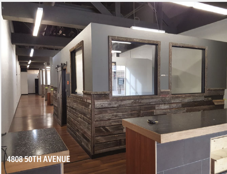
4808 50TH AVENUE