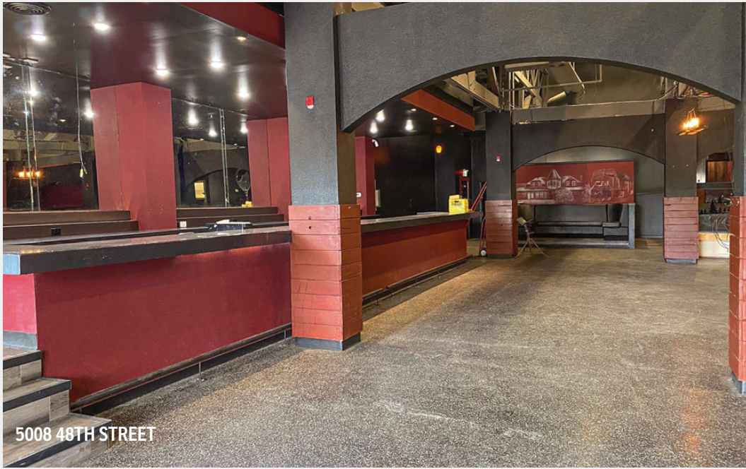
5008 48TH STREET