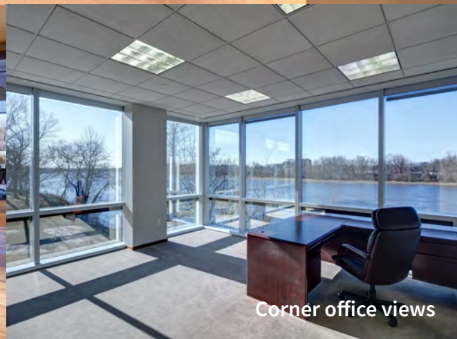
Corner office views