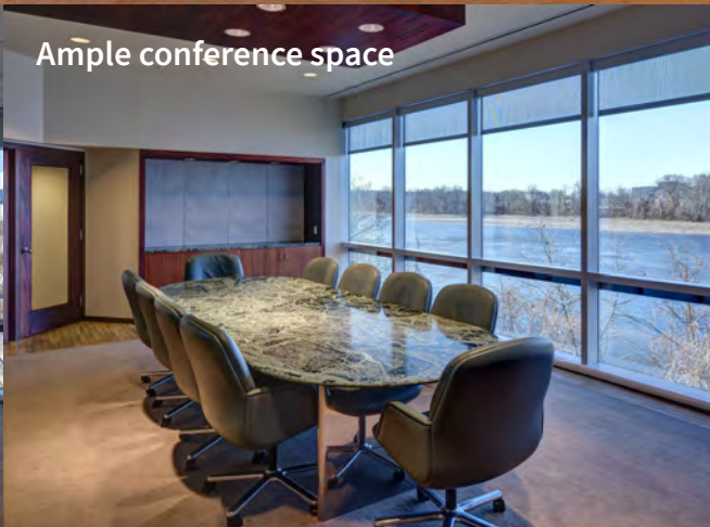
Ample conference space