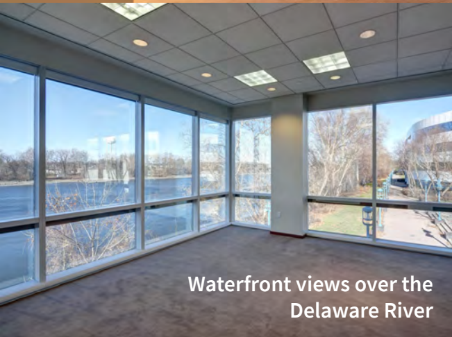
Waterfront views over the Delaware River