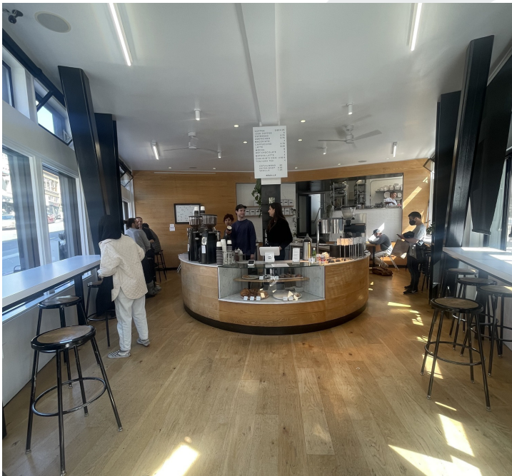
222 Columbus | Cafe Reveille