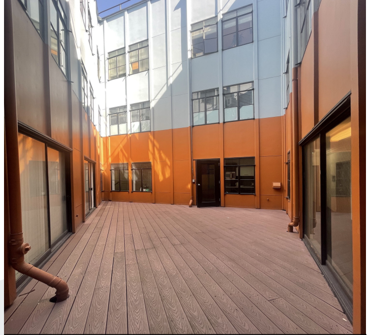
222 Columbus | 2nd Floor Common Area Atrium Patio