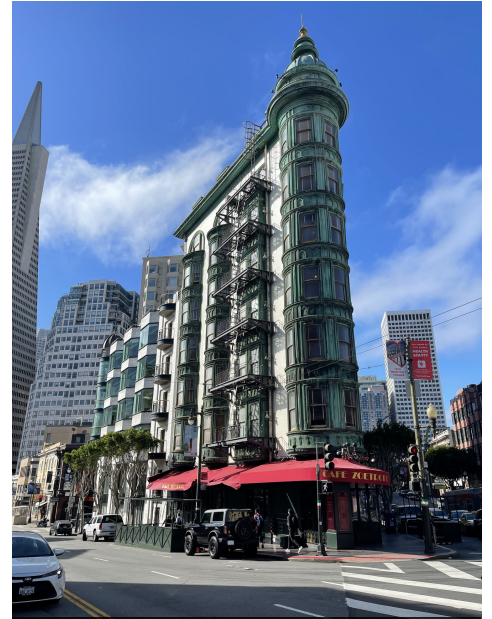
Francis Ford Coppola Building