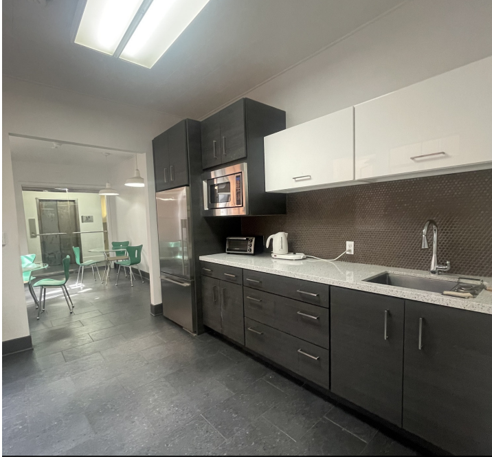
222 Columbus | Common Area Break Room Amenity