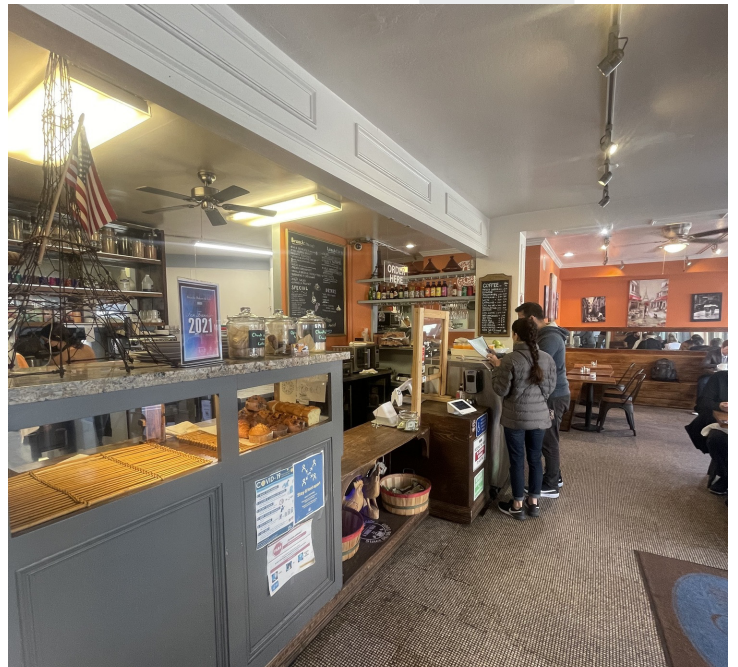
222 Columbus | Brioche Bakery & Cafe