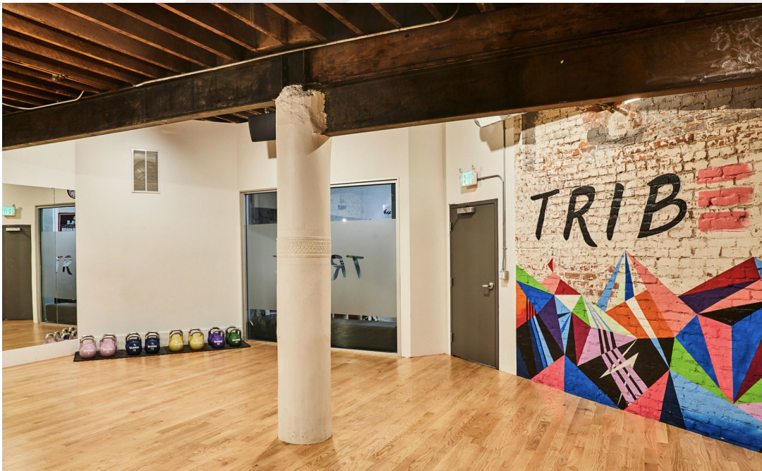
222 Columbus | Lower Level | Tribe Fitness