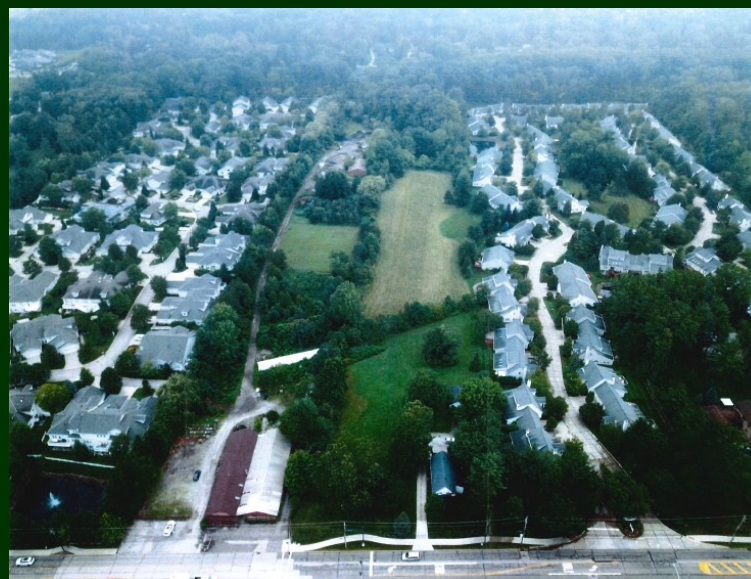
Miles Road, Orange Village, Ohio 44022

No warranty or representation, express or implied, is made as to the accuracy of the information contained herein. It is submitted subject to errors, omissions, price changes, rental or other conditions, withdrawal without notice, and to any special listing conditions imposed by our client.