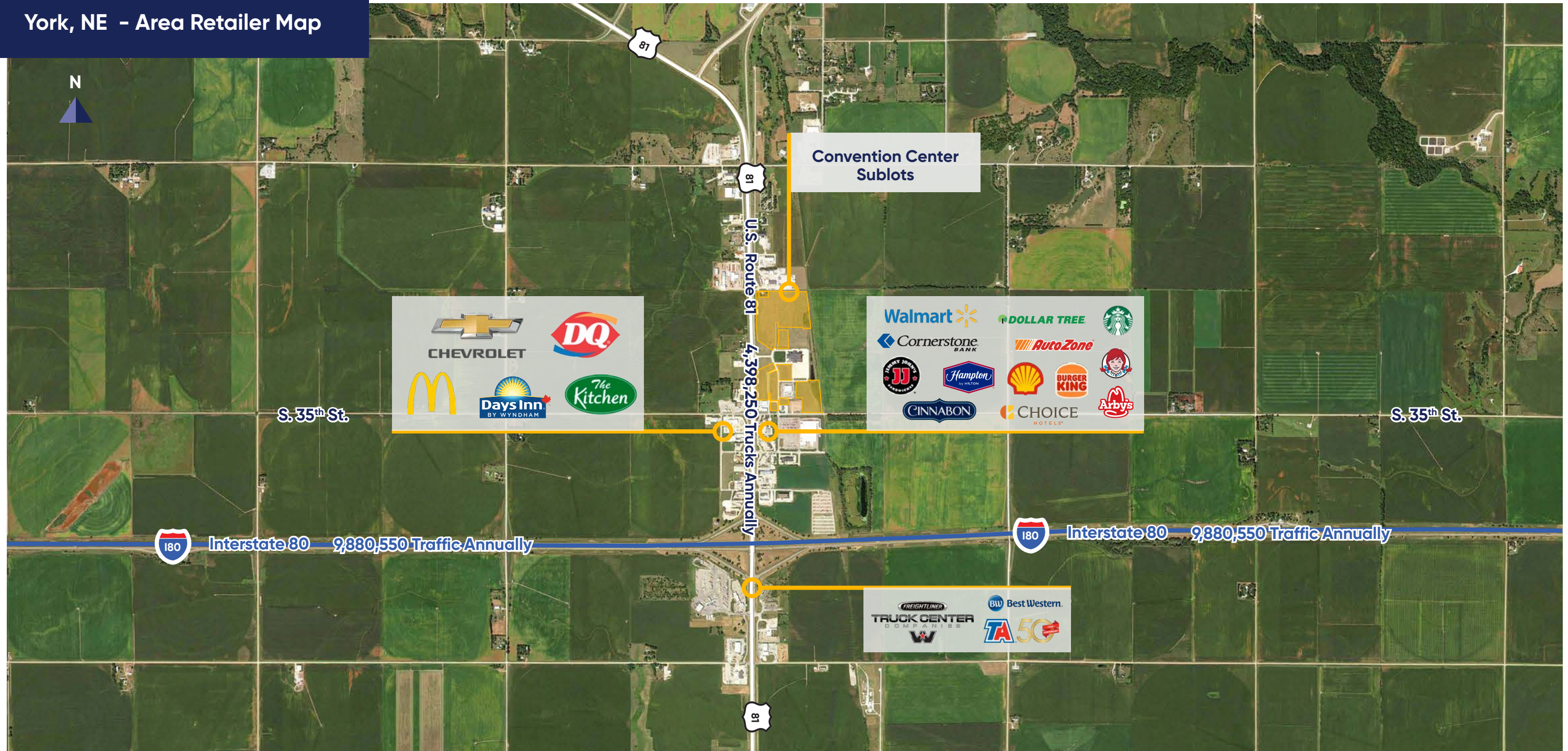
York, NE - Area Retailer Map