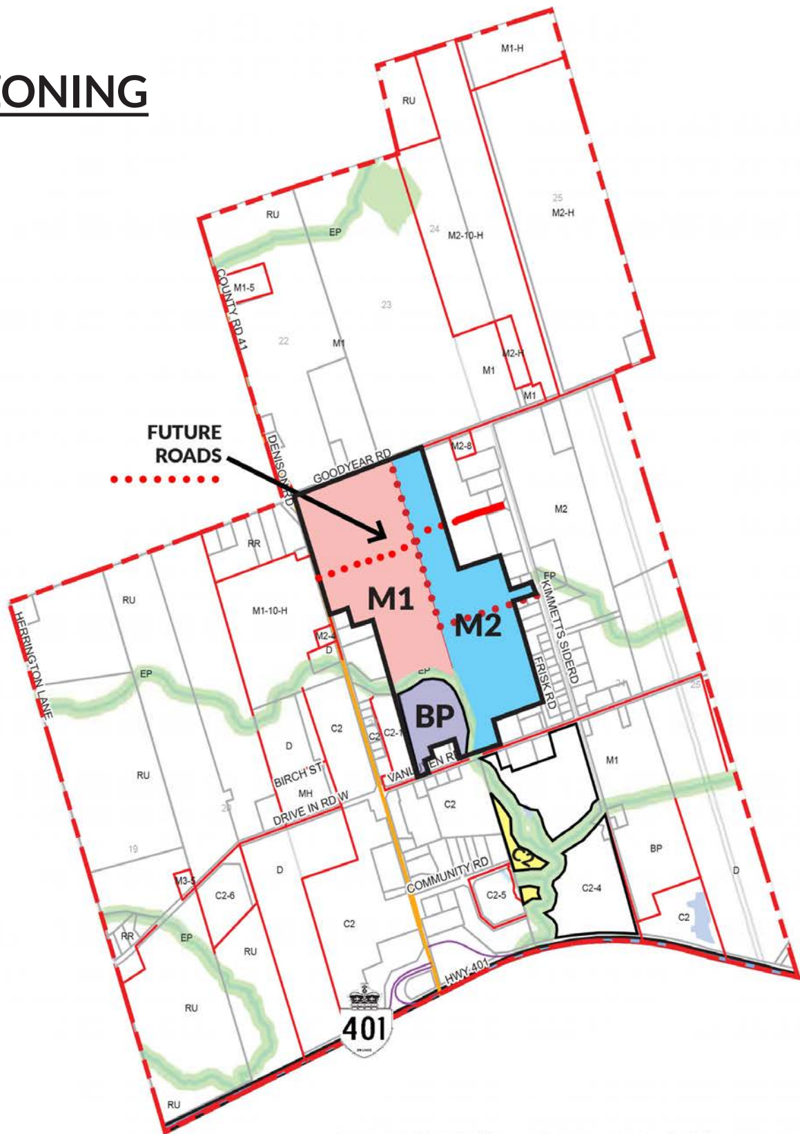
ZONING (By-Law 02-22)