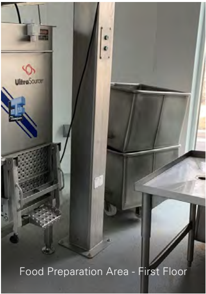
Food Preparation Area - First Floor