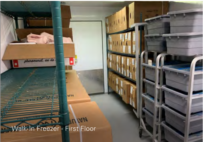
Walk-In Freezer - First Floor