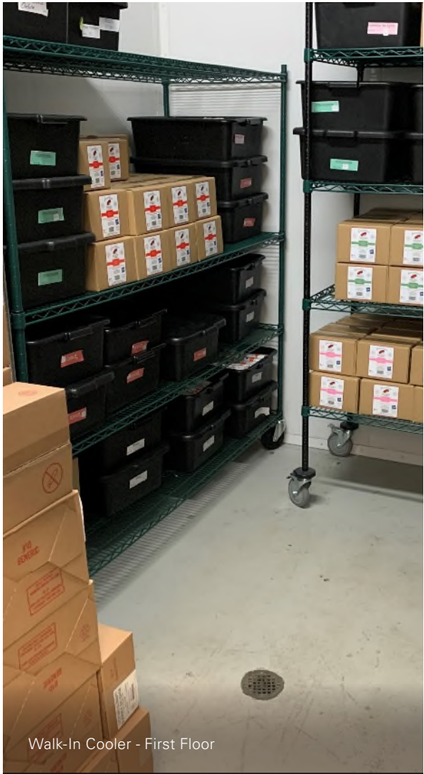
Walk-In Cooler - First Floor