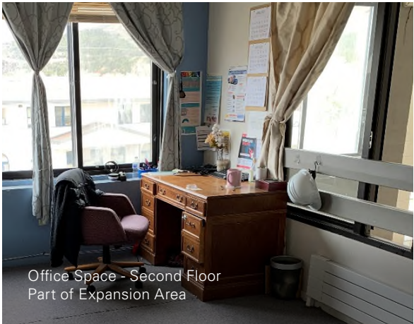
Office Space - Second Floor Part of Expansion Area