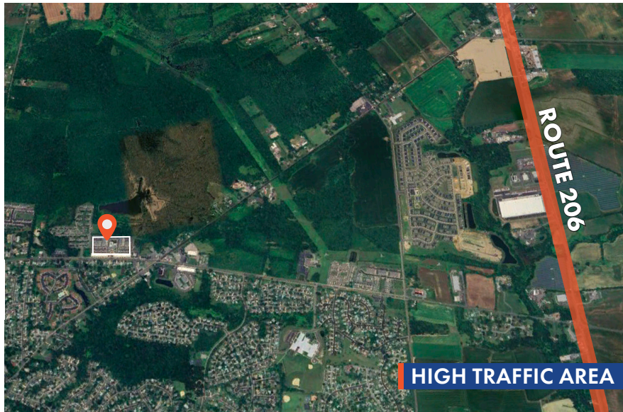
HIGH TRAFFIC AREA