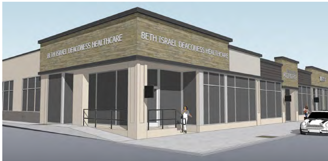
Corner View B