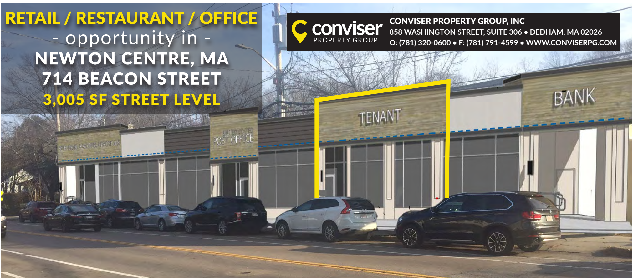
NEW FACADE CONCEPTUAL RENDERING - SUBJECT TO MODIFICATION

CONVISER PROPERTY GROUP, INC 858 WASHINGTON STREET, SUITE 306 • DEDHAM, MA 02026 O: (781) 320-0600 • F: (781) 791-4599 • WWW.CONVISERPG.COM