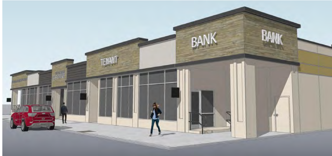
Corner View A

NEW FACADE CONCEPTUAL RENDERINGS - SUBJECT TO MODIFICATION