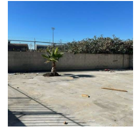
2,000sf patio/yard space free of rent