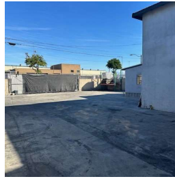
Gated parking / front yard