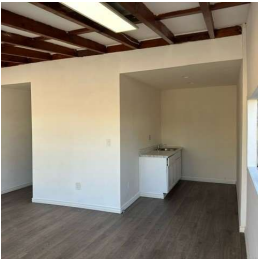
Clean New Interior Buildout with kitchenette