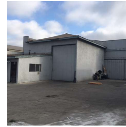
two large drive ins