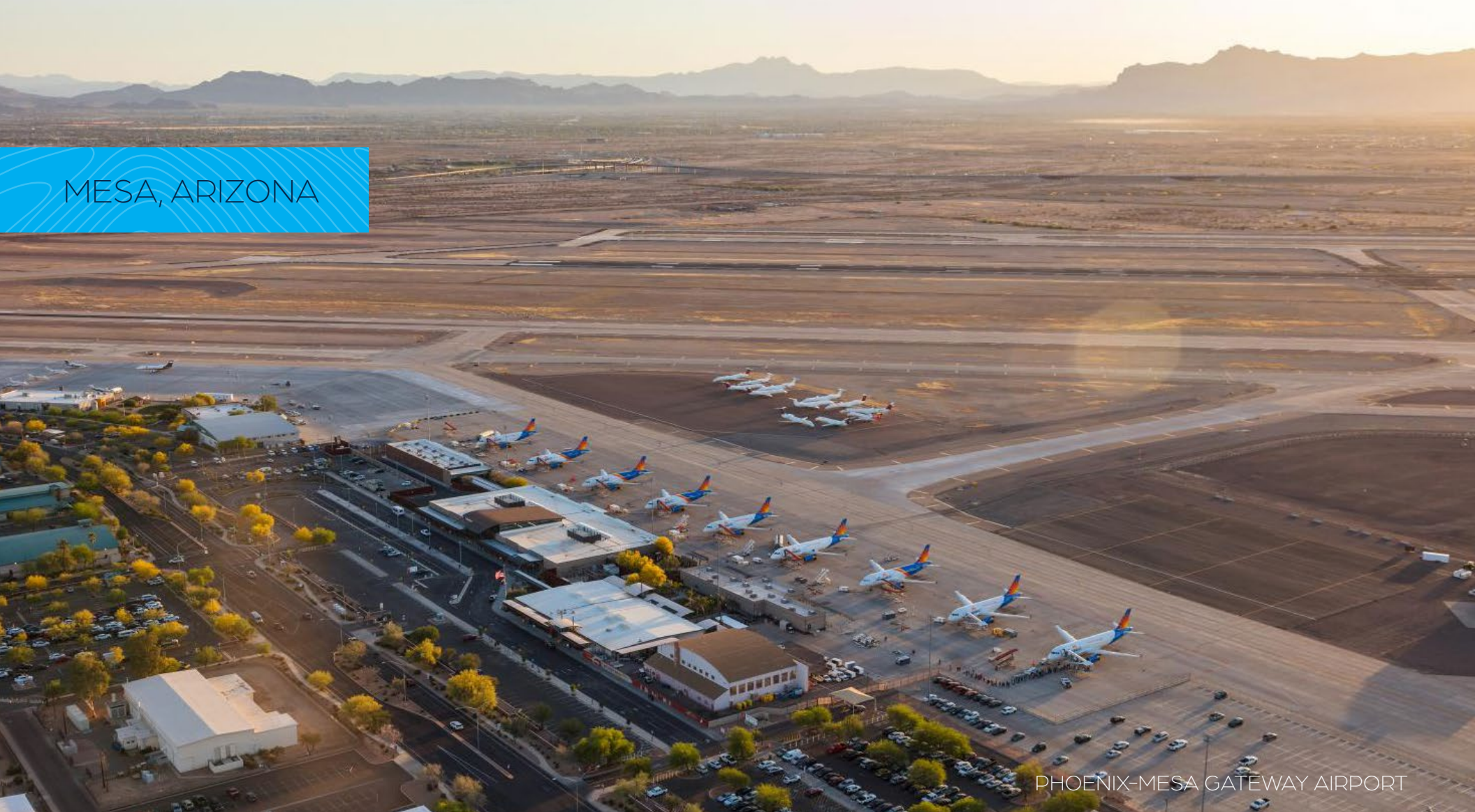
PHOENIX-MESA GATEWAY AIRPORT