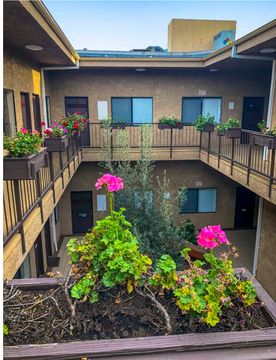
COURTYARD, SECOND FLOOR