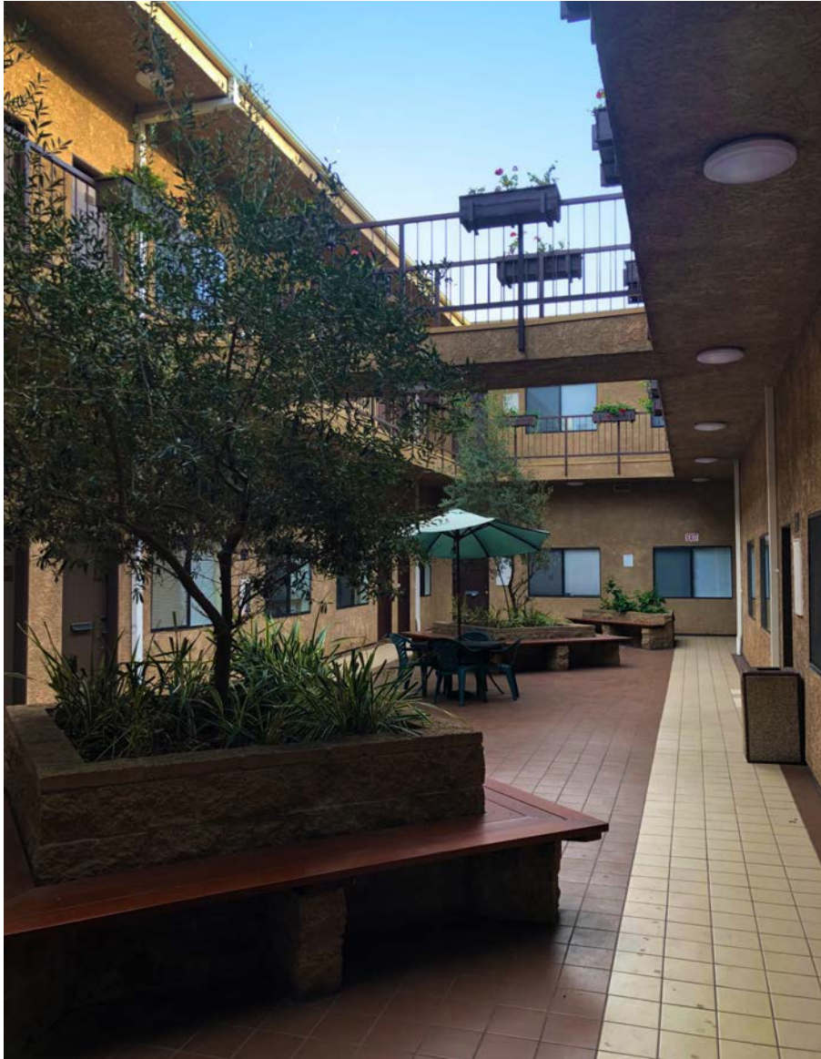
COURTYARD, GROUND FLOOR