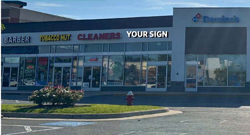
Suite 1110 - 1,048 SF