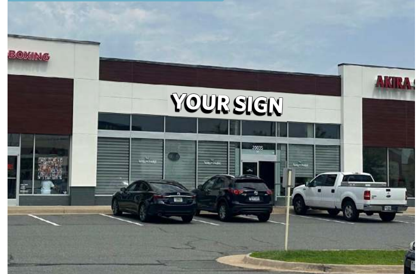
Suite 3147 - 3,036 SF